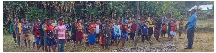
Early morning singing, prayer, and announcements at the flagpole

Before classes began, the teachers first had the students perform tests to make sure they were placed in the proper grades. There are now 83 students attending Kindergarten through seventh grade.