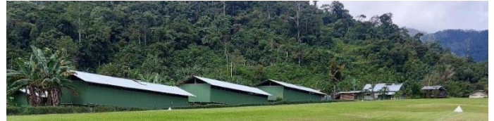
Christian School campus on the edge of the Hewa airfield, with our house and church at the far right.